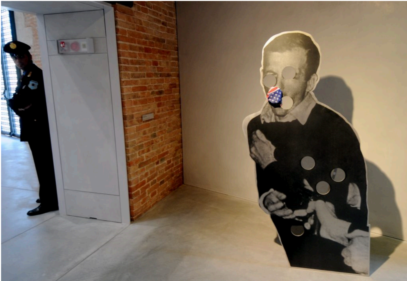
Cady Noland, Oozewald (1989) installed at the Punta della Dogana in Italy in 2009.